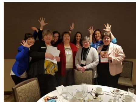
Photos from our February dinner meeting, where we reached 10 members!