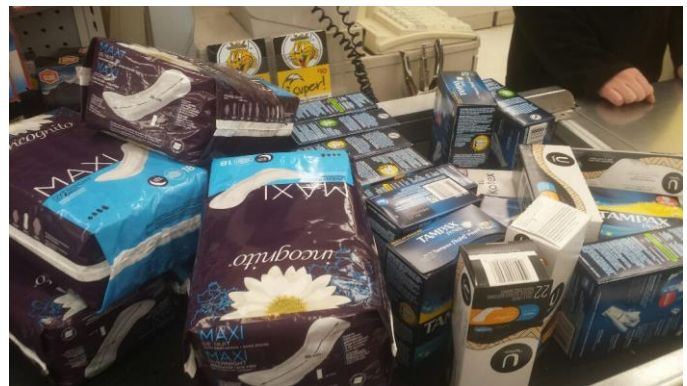
EWI of Saskatoon's Moon Time Sisters donation