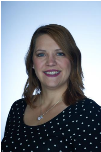
February 2019 Presidents Message

February, already ... Wow! Where has the first month of 2019 gone! I trust everyone's year is off to a great start, and your resolutions are still holding strong, I know I have hit a few bumps but I am still trying to keep them front of mind and continuing on!